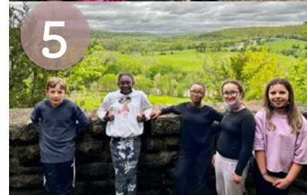
1 Roasting marshmallows on the grill for yummy s'mores 2 Building forts together in the woods 3 Thrivers making their own petroglyph-inspired necklace 4 Thrivers hiking the "1,000 Steps Trail" 5 Scenic overlook while taking a break on the trail 6 Naturalist-guided tour of the Petroglyphs, created by indigenous peoples of this region long ago