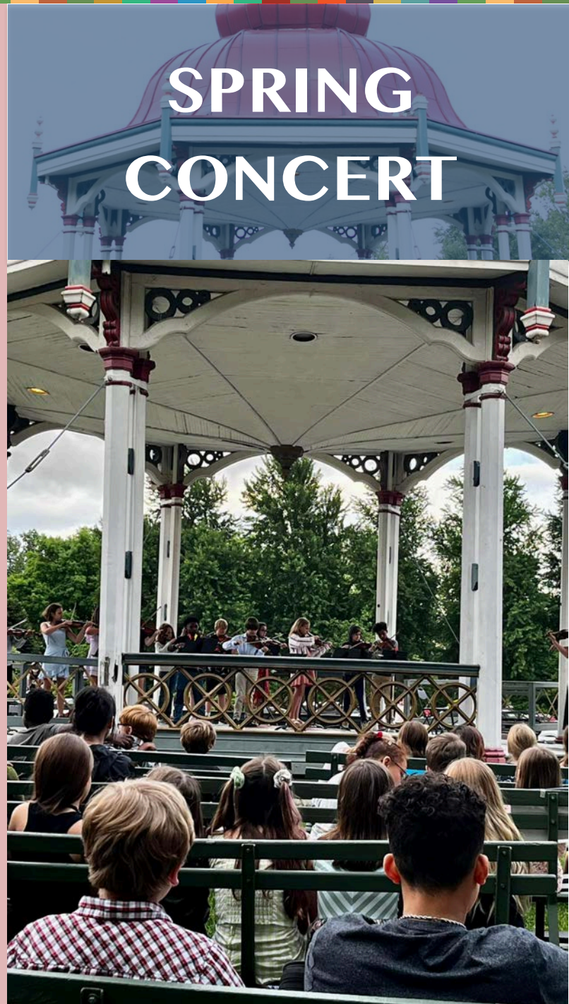
The Soulard School community gathered at the Tower Grove Bandstand for our annual showcase of musical talent and the students' hard work.