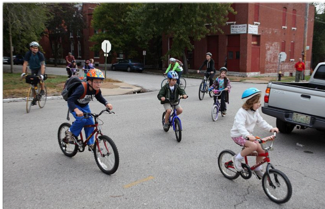
Riders from the Tower Grove meet-up spot pull into the circle drive on Bike to School Day:

Friday-Sunday, October 7-9 , various times