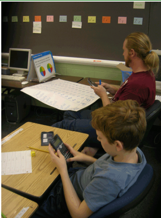
The Thrive class studying statistics! What are the odds of a great year? 100%