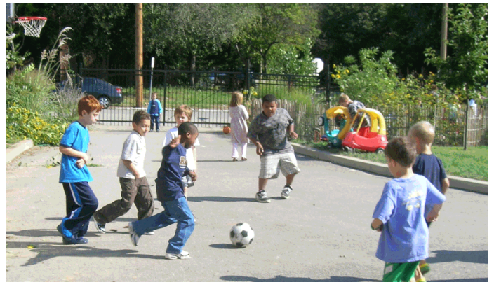
Recess in action. A group of students organize a game of soccer.