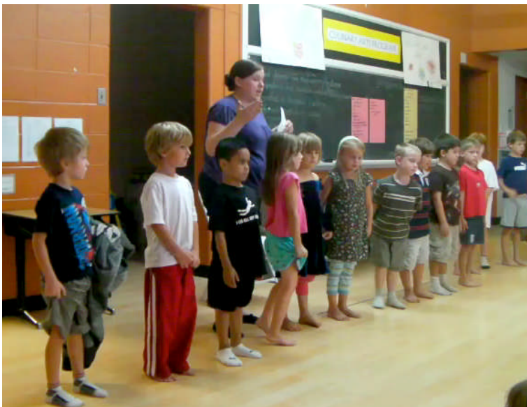
The Subjunctive class presents their goals at the September 14 assembly.