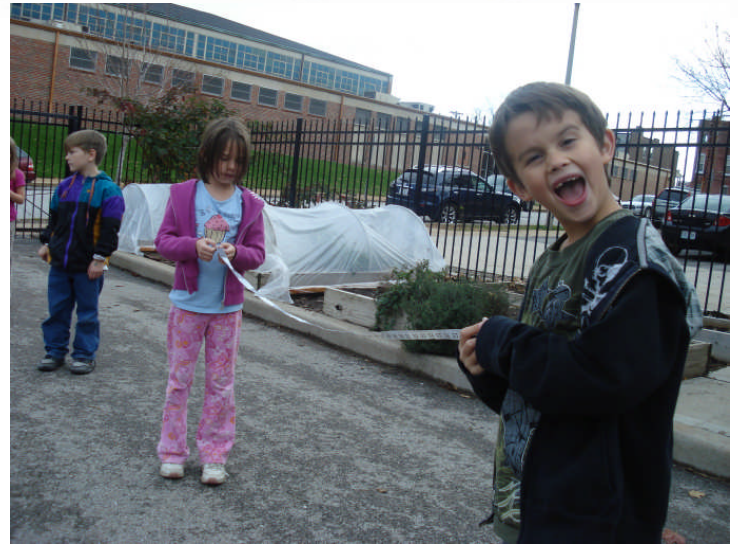
The second grade Mums use their measurement skills to measure the size of the keelboat, Lewis' and Clark's boat, 55-feet long, 8-feet wide.

What were they thinking? Ever wonder how critics criticize? How do writers look at art and put abstract concepts into words? How do writers describe art while respecting the artist? How do writers deal with abstract concepts that seem to defy description? StudioSTL writers will take a stab at all of these questions and more with an incredible personal tour of the Gordon Matta-Clark exhibit on urban landscapes. We'll jot notes, chat, and pen our personal reactions to the most important question of all: What do WE think?