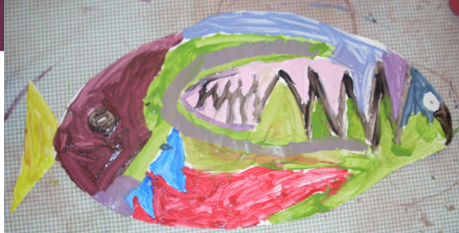
Design Studio with Subjunctives: a finished butterfly fish by Isaac. See page 4 for more details.