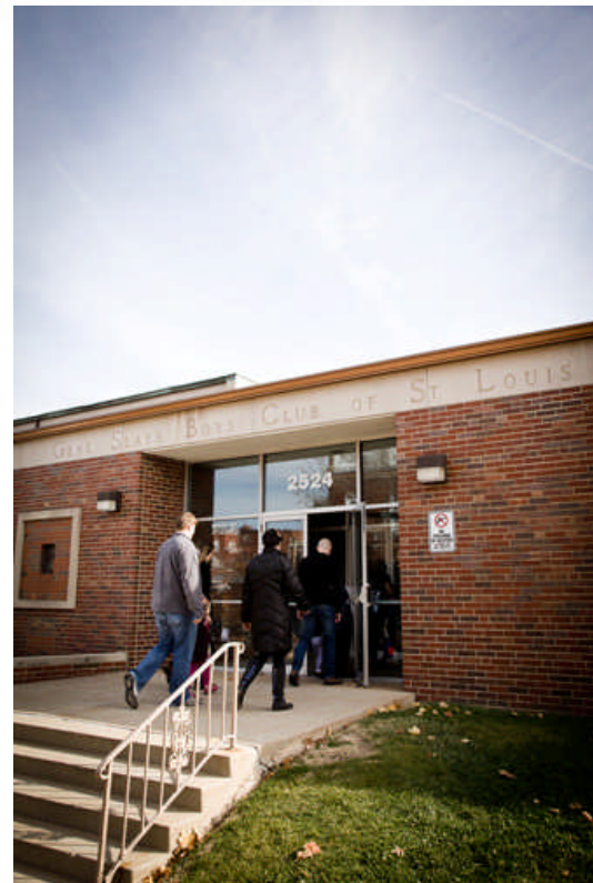
Guests begin to arrive at Gene Slay's Boys Club for the Feast of Thanks.