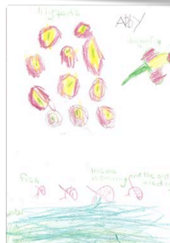
A few of the sketches from Hugo, Nigel, and Abby.

After studying the pond ecosystem, the Mums visited the Art Museum to explore Monet's paintings of his pond. We searched for patterns, shapes, and colors in Water Lilies and Blue in Harmony and pointed out the natural elements depicted in Water Lilies, Triptych . Then, we "jumped" into the painting and imagined what else we would see at Monet's pond, drawing them in our sketchbooks. Before leaving, we pretended a treasure chest sat at the bottom of the pond and reached our hands inside to pull out something special. During Writers' Workshop, we journalled about our treasures.