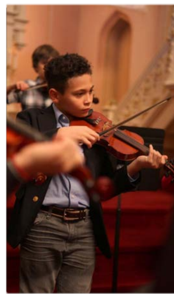
We had our winter concert at historic Trinity Lutheran Church in December. The students loved performing in such a wonderful venue, and the concert was well attended.

There are some exciting activities planned for the spring-students will be learning about sound and designing their own musical instruments. We will be learning about the nature of sound, radio, and light waves and take a trip to KDHX to see a radio station in action.