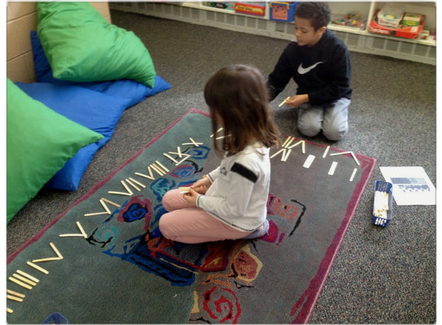
Reilly and Sorena creating Roman numeral symbols.

Time is flying across the Mosaic room. During writer's workshop we wrote about an imaginary train trip across North America. In order to arrive timely we learned about standard, pacific, and central time zones. During the planning process we created a map and legend with their specific route. Along with that, we learned details of telling time to the hour, half hour, quarter hour, minute, and second. We also did a home study to determine how many and what kind of clocks were in their daily environment. We were looking for analog and digital; however, some students found Roman numerals on the clocks. We expanded our studies to learn about the history of Roman numerals and how to identify the symbols. We experimented with craft sticks and tooth picks to create a variety of patterns for better representation and understanding of this system. We completed the time study with equations involving time; converting hours to minutes and determining total minutes from larger whole numbers to hours and minutes.