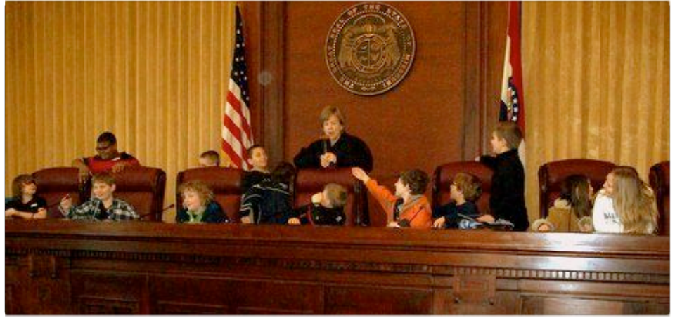
Thrivers test out the Supreme Court judge's perspective during their trip to Jefferson City. For more, see page 2.