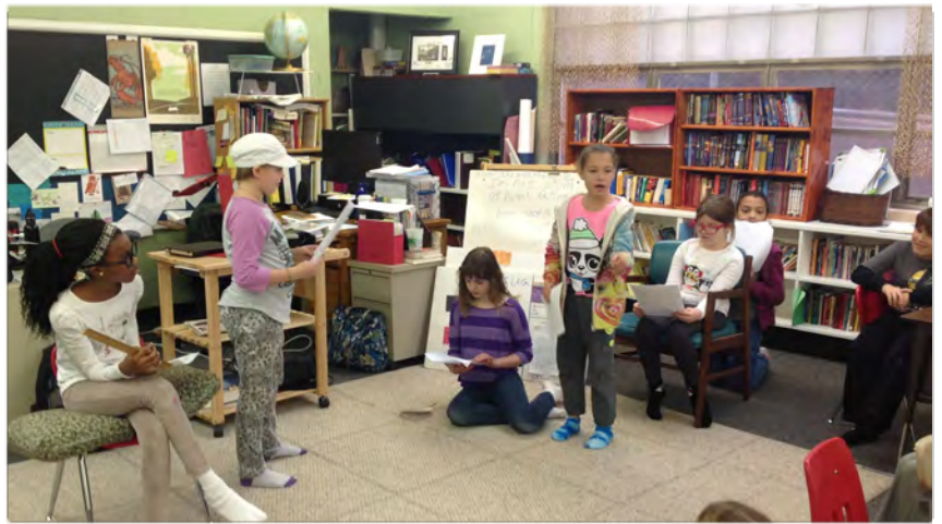
Thrive students perform an Egyptian myth during reader's theater.