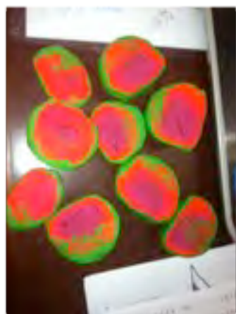
<< Creating the layers of the earth using play-doh.