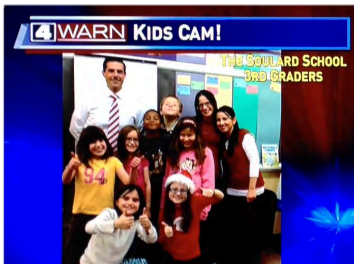
Alchemy hosts KMOV's Chief Meteorologist, Steve Templeton during their study of the weather.

We were able to easily tie literacy into the exploration of our volcanoes by discussing the different aspects of non-fiction books; such as captions, the table of contents, and the index. Our study crossed curriculum again during writer's workshop when students wrote a short research paper about our specific volcano type. We wrote informational paragraphs that included topic sentences, support, and conclusion sentences. As a culminating project, we constructed our own volcanoes at home and erupted them at school. This experience allowed all of the students to further gain a deeper understanding of three types of volcanoes.