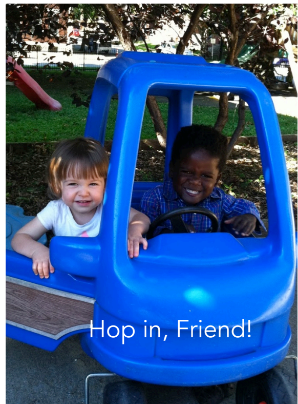
Hop in, Friend!