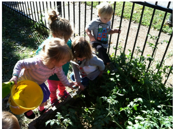
Toddlers pruning the garden and picking ripe tomatoes.