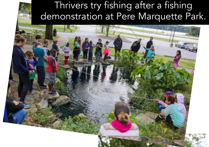
Thrivers try fishing after a fishing demonstration at Pere Marquette Park.