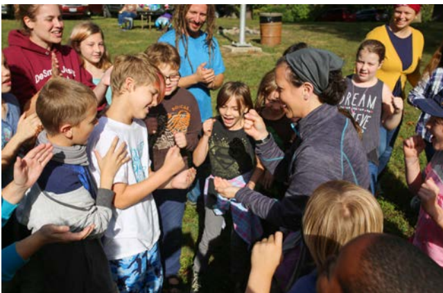
The war of rock paper scissors ends, or does it?