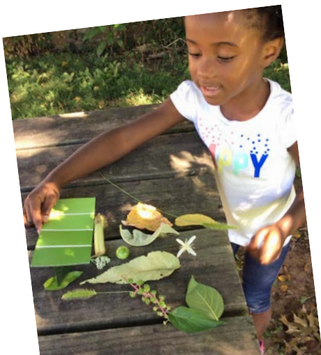
Hailey uses careful observation skills to find objects that match the colors on a paint sample.

All hands on deck! Keep your eye out for the November 1st launch of our Annual Appeal. The Annual Fund directly supports our Equitable Tuition Program, and last year was another great year. We exceeded our $40,000 goal and raised $51,067 - WOW!! Let's make that happen again! This year's goals are to raise $45,000, achieve 100% family participation, and add four new members to our Grandparent Scholars Club.