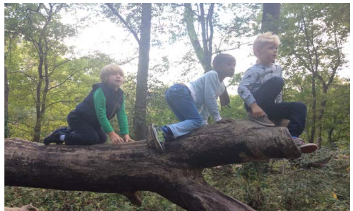
Mums students (K) exploring at Litzinger Road Ecology Center.